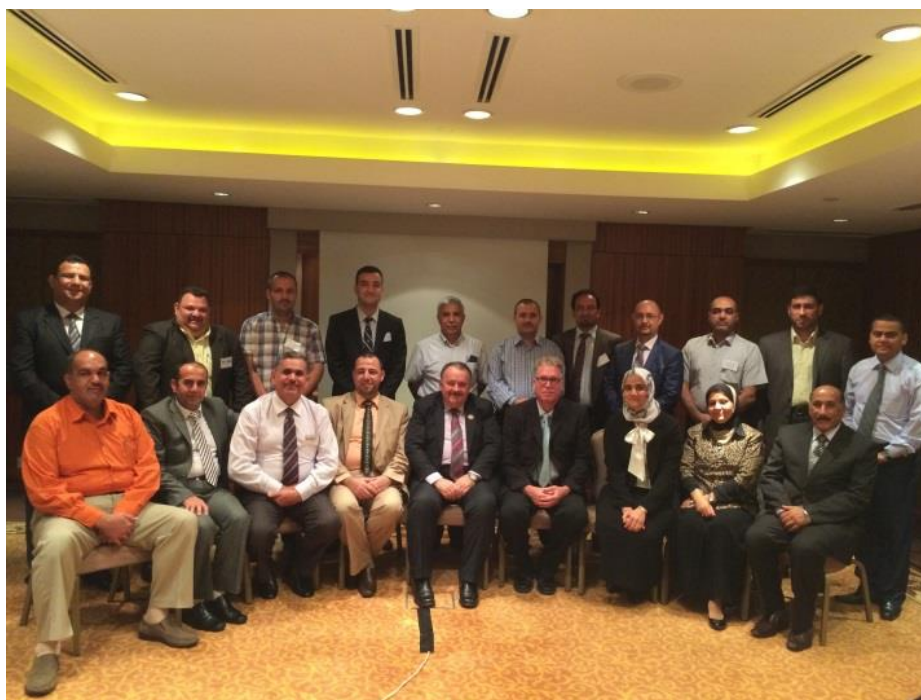
Picture .1. Participants from Iraqi universities in a CSP workshop. Malaysia. October 2014

Based on long history of working with the Iraq government, there is a bad experience about joint project with international organization after 2003. Although CSP has a very clear plan to build and improve capacity of faculty via series of workshops with a sequential topics, Iraqi universities have used to send different faculty member every time to participate in this series. They are handling this participation as an opportunity to learn general information and spend good time during traveling outside Iraq whereas this series requires participation of the same faculty member to build his capacity progressively. Thus, while building capacity of Iraqi faculty is a critical need, building capacity of university administrators is an issue. The key is working with a good administration of a university. This requirement supports the crucial need of integration in building of Iraqi universities, a systematic building of capacities is required for administration and staff along with classrooms, laboratories and offices. In other words, a comprehensive plan of building and development is required, which is missing in Iraqi universities.